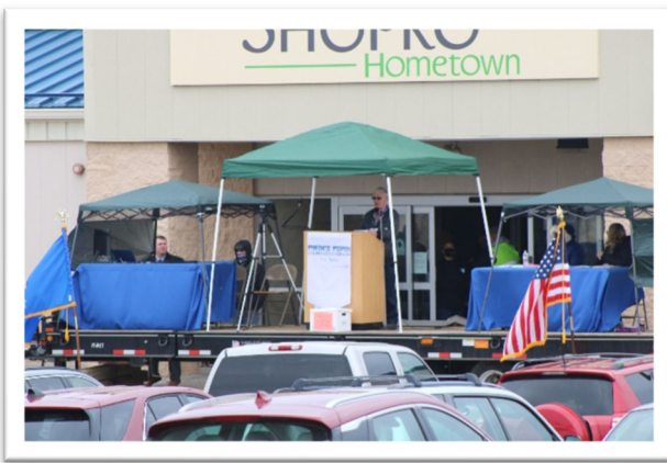
More than 114 members and guests attended the PPCS 84 th Annual Meeting, March 27, 2021.