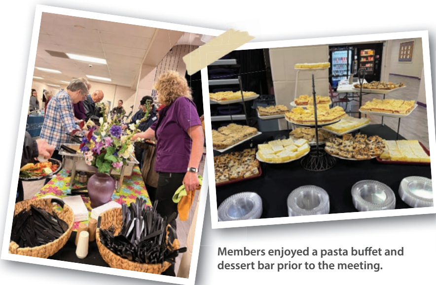
Members enjoyed a pasta buffet and dessert bar prior to the meeting.