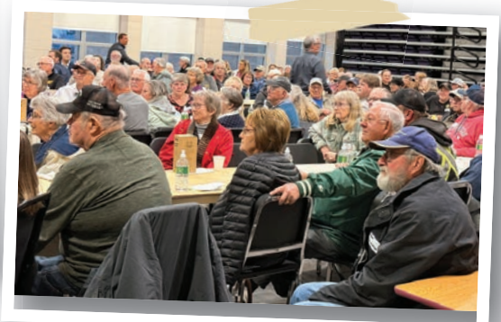
Members voted, listened to updates, and had a lively discussion regarding questions and concerns.