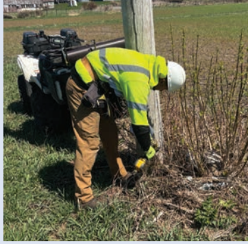
Utili-Tech Solutions will be pole testing in the eastern section of River Falls Township.

PPCS provides you with safe, reliable electricity. Although some things interfere, things beyond our control, like lightning, high winds, tornadoes, ice, and snowstorms, we work hard to prevent blinks and power outages. PPCS has contracted with Utili-Tech Solutions to do pole testing to help maintain the integrity of the overhead infrastructure. The testing began in May and includes the eastern section of River Falls Township. Call our operations department at 800-924-2133 if you have any questions.