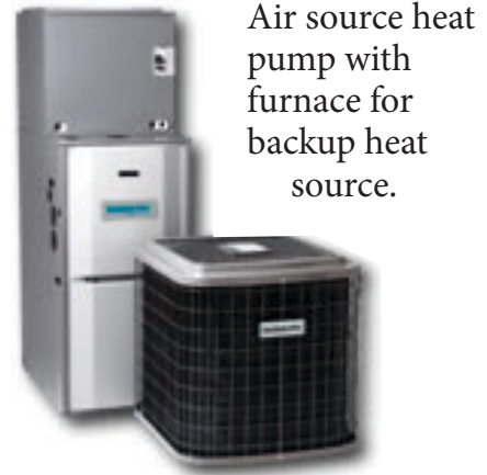
Air source heat pump with furnace for backup heat source.

For more information, call your Pierce Pepin Cooperative Services energy advisors or visit www.piercepepin.coop .